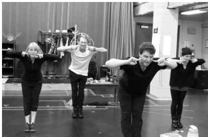
Ensemble in rehearsal